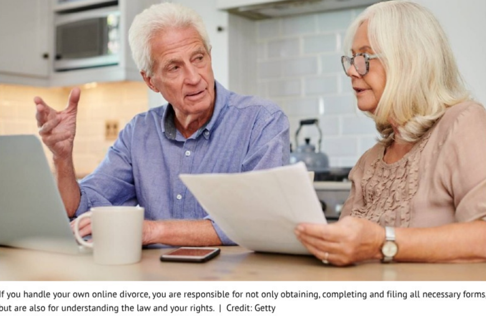
If you handle your own online divorce, you are responsible for not only obtaining, completing and filing all necessary forms, but are also for understanding the law and your rights.

So much of life is online at this point. We pay bills, do banking, renew passports, work, connect with friends, have meetings, shop, file taxes and do just about everything else online. What about getting a divorce?