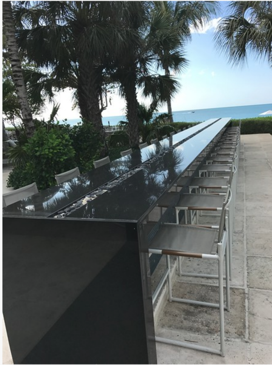
The Longest Beachside Bar in Caribbean

If you're going to the best beach in the world, you want a comfortable, pampered way to enjoy it. The Grace Bay Club was the perfect fit for us. They offer an adults-only section and accompanying pool, personal concierges, spa, comfy cushioned pool and beach loungers with umbrellas, spacious rooms, the longest beachside bar in the Caribbean, plus lots of amenities that will get you moving.