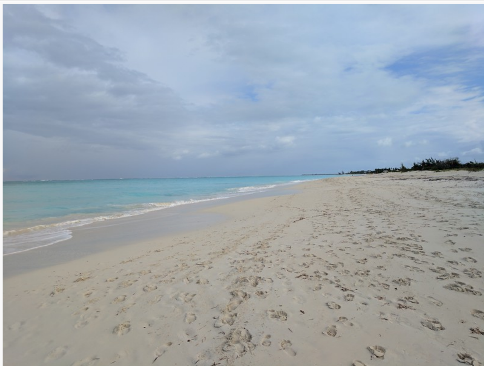
Grace Bay: The World's Best Beach

The best thing about Provo is that it's not too big and not too little—it's just right. At only 23 miles long, it's small enough that you can actually see everything in a four- or five-day, visit but big enough that you won't feel bored. Most Providenciales hotels and resorts are clustered in the five-mile area of Grace Bay which is consistently named the best beach in the world. With powder soft sands, virtually