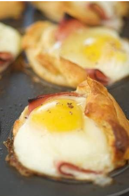
Brette Sember's crescent egg cups put a yummy, kid-friendly twist on breakfast.

Written by KIM MOLFORD Courier-Post Staff