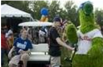
Third Annual Chicken Run in Haddonfield