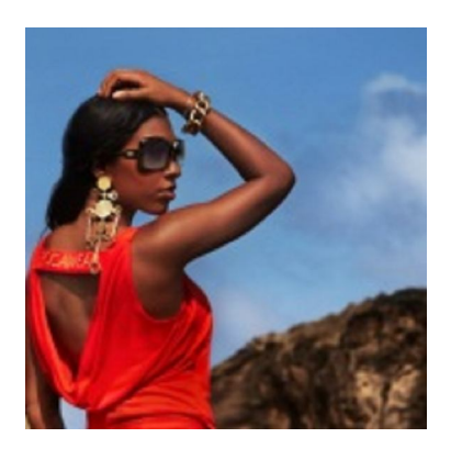
Elizabeth & James Sterling Silver Quill Drop Earrings