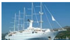
Photo tour of Windstar Wind Surf Hotels