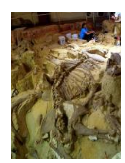
visit the Mammoth Site of Hot Springs

Haven't had enough brushes with the natural world yet? Block out a few hours to visit the Mammoth Site of Hot Springs in the southern part of the Black Hills area. At the beginning of the 20th century, the town of Hot Springs was a tourism magnet because of the healing waters of the springs and the now mostly rundown town is truly beautiful with its buildings of quarried red rock.