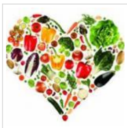
What Color is Your Smoothie plus giveaway (4/5)