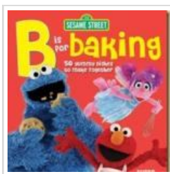
B is for Baking

If you enjoyed this post, please consider leaving a comment or subscribing to the RSS feed to have future articles delivered to your feed reader.