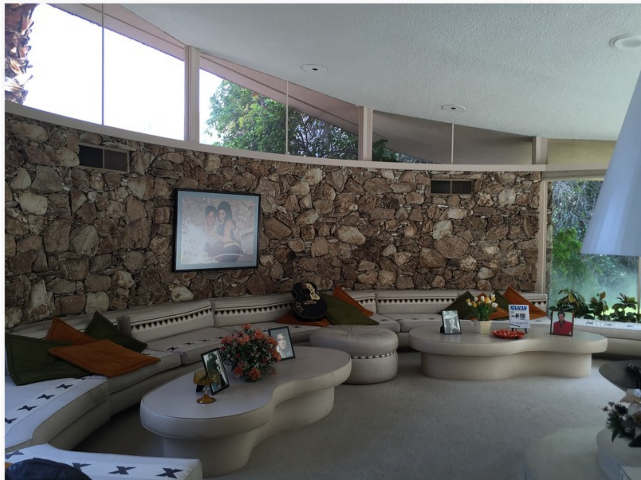
That's one large couch!

This is a trip back in time because it is frozen in the 60s (I was fascinated by the kitchen with the built-in charcoal grill and mixer). The home is also architecturally significant. It's visitor-friendly, photos are welcomed, and you can sit on the giant couch or the bed (THAT bed), or even climb in the weirdly deep tub if you so desire.