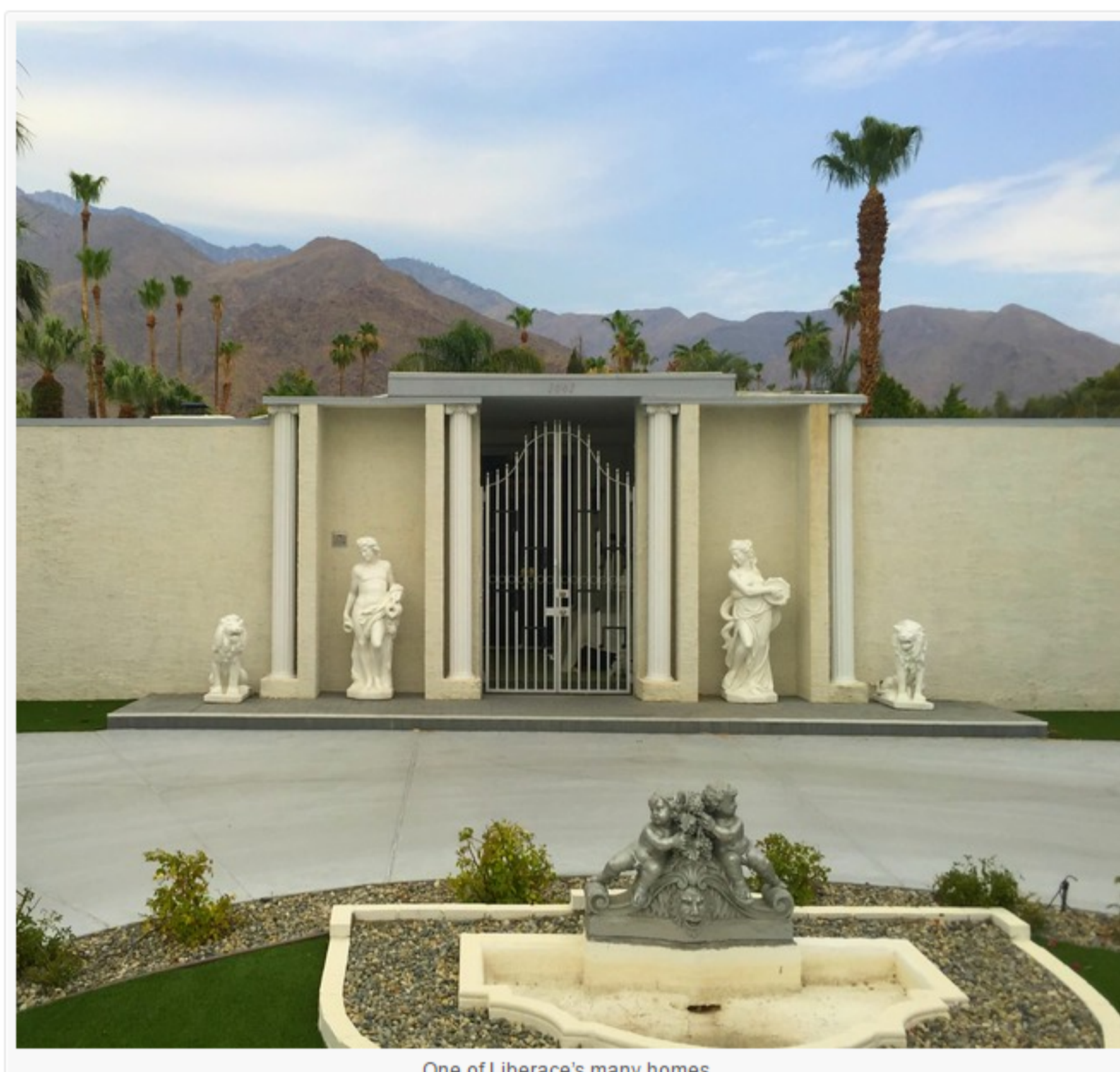
One of Liberace's many homes.

Palm Springs developed as a getaway for movie stars who were contractually bound to be within 2 ½ hours of the LA area. As a result, there are dozens and dozens of famous homes in Palm Springs. You can take a self-guided driving tour , but for the full experience, I recommend a guided tour for all the fun stories and details about what is inside the homes. We took Celebrity Tours' half-day tour, which included a break halfway through for a local specialty date shake (delicious!).