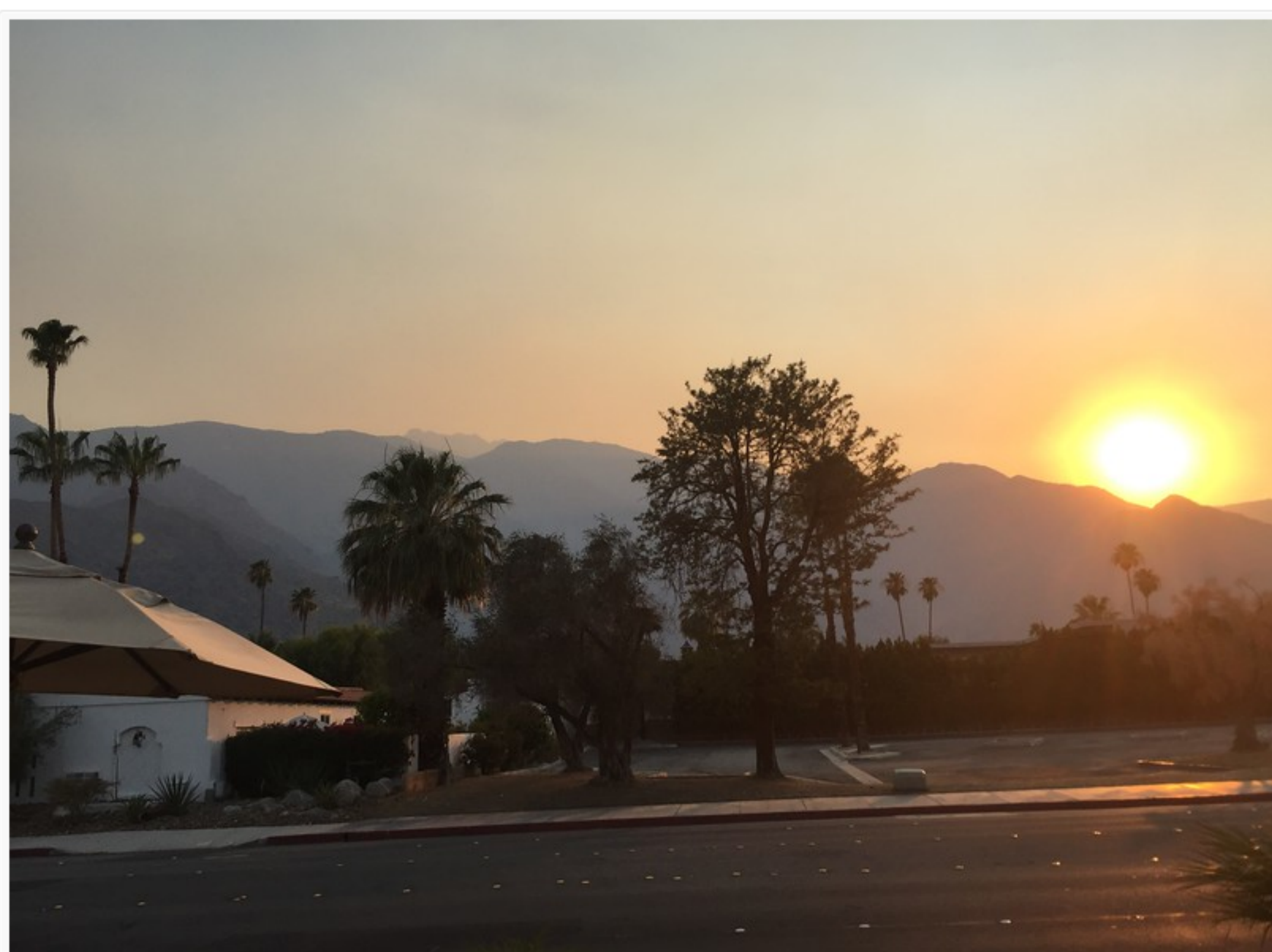
The surrounding mountains around Palm Springs make for some amazing sunsets.

Once you adjust to the heat (and it really is a dry heat!), you'll find that Palm Springs has an interesting low-key vibe. It doesn't even seem like a city when you drive through. All the buildings are low, the main strip is only a few blocks long, and there are not many people outside walking or doing much of anything in the heat of the day. It feels quiet and gently paced. Things feel laidback, but a lot going on that you don't initially see.