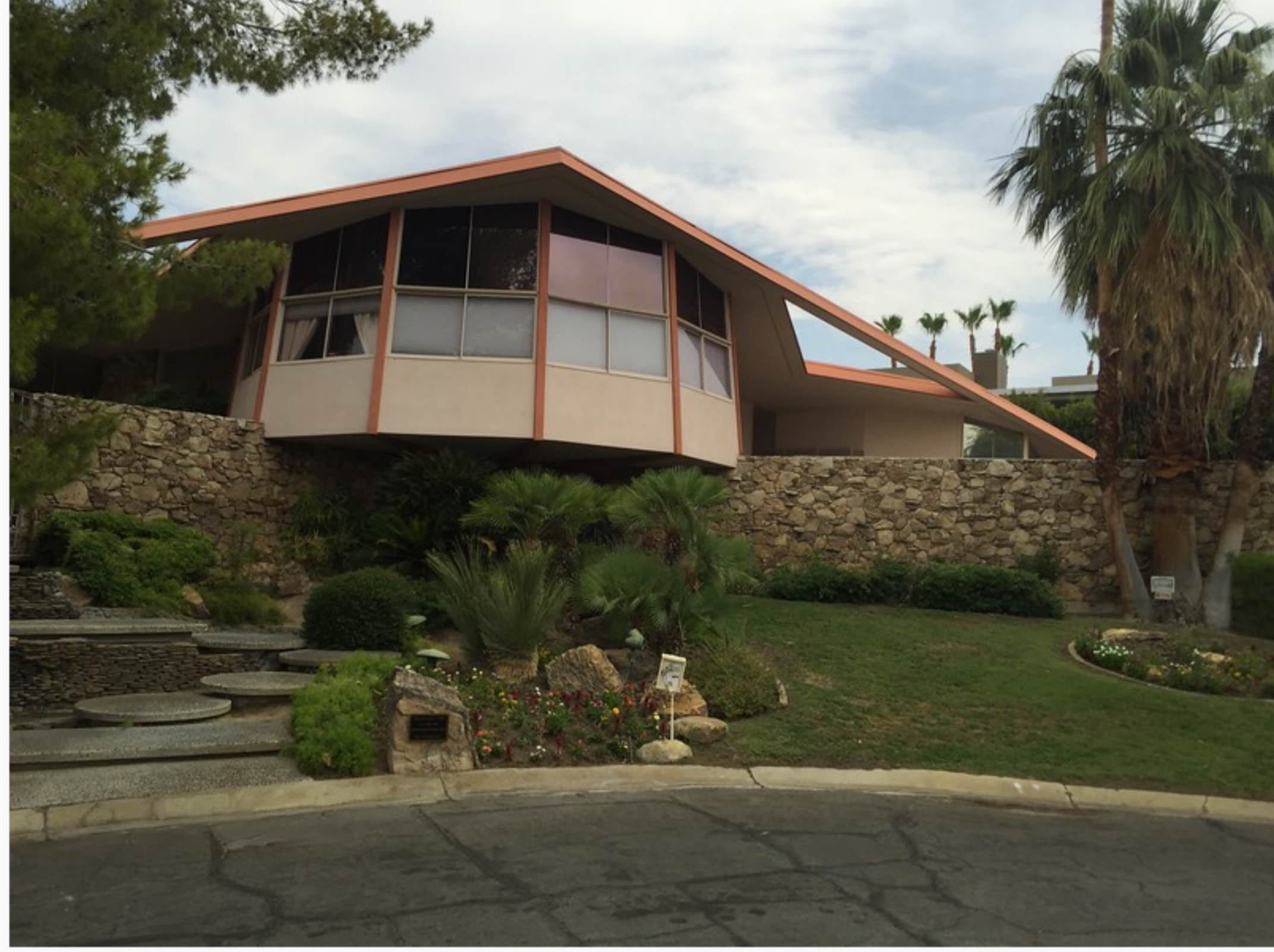
Elvis Honeymoon Hideaway.

Whether or not you are an Elvis fan, be sure to schedule a tour of the Elvis Honeymoon Hideaway . If you take a bus tour, it will drive past it, but I highly recommend scheduling a tour inside the home which is in nearly the exact condition it was when Elvis and Priscilla lived there the first year of their marriage (this is also the home they were living in the day they got married and you'll get to see the escape route they used to avoid the press).