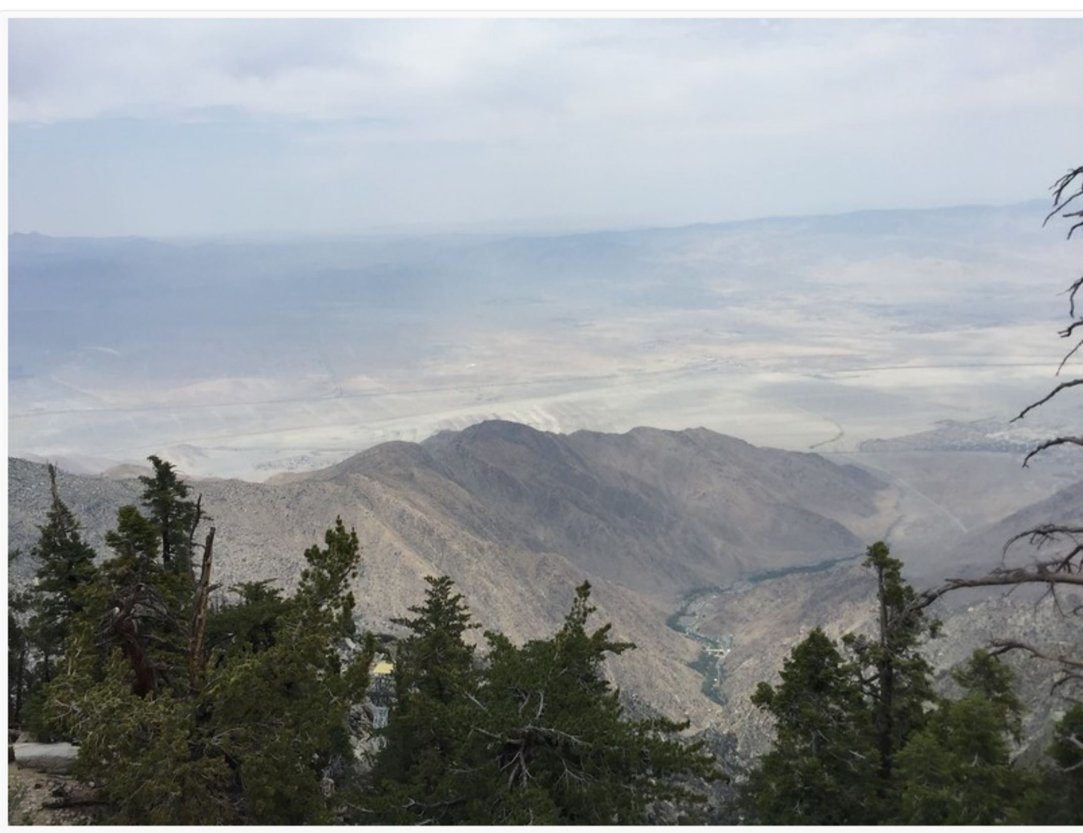
Beautiful views from the mountains.

I was inspired by the scenery of Palm Springs: a flat desert with palm trees encircled by mountains. Things are even better once you head up into the mountains. And the best news is, it's 20 degrees cooler up there. For the ride of a lifetime, take the Palm Springs Aerial Tramway up 2.5 miles to 8500 feet in the San Jacinto State Park .