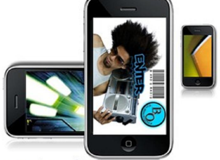
FROM $99.99 CLICK HERE!