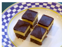
Hitting the trail in Nanaimo