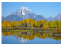
News for the Week