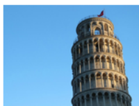
Top Five Apps For Italy Travel