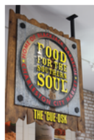
Five Apps for Staying Healthy While Traveling