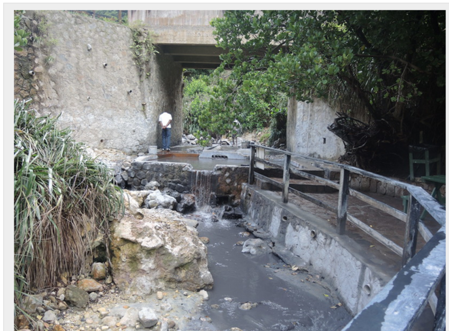
Playing in the mud at Soufriere Springs

Whether you come to St Lucia by cruise ship or to stay on the island, you'll find plenty of things to do. In just one afternoon my family and I experienced some of the best of what the island has to offer. We rented a car, but excursions or drivers can also be arranged.