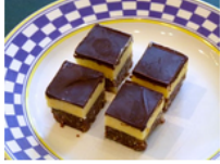
Hitting the trail in Nanaimo