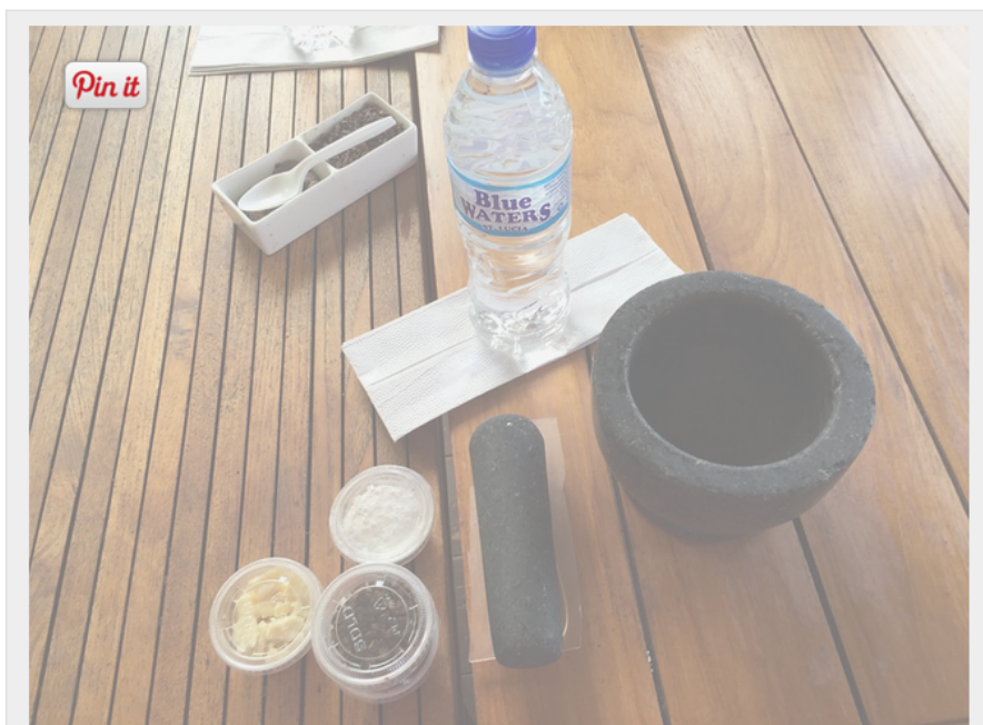
Learning to make chocolate bars in St Lucia

Once you're wet, you'll climb out the other side and stand in a trickling stream while friendly attendants bring over a bucket of fresh sulphur mud and madly begin smearing it all over your legs and arms. Fortunately, they then let you cover the rest of your body yourself and helpfully take a photo with your camera. You go back into the pool and rub the mud off and relax. When you emerge, your skin feels incredibly soft, but the price for silky skin is that you stink of sulphur. Head directly to the outdoor (cold!) showers! There are dark little changing rooms where you can dress. Don't be alarmed if one of the mud attendants says "pssst" and clandestinely holds up a bag of mud for you to buy (we politely passed).