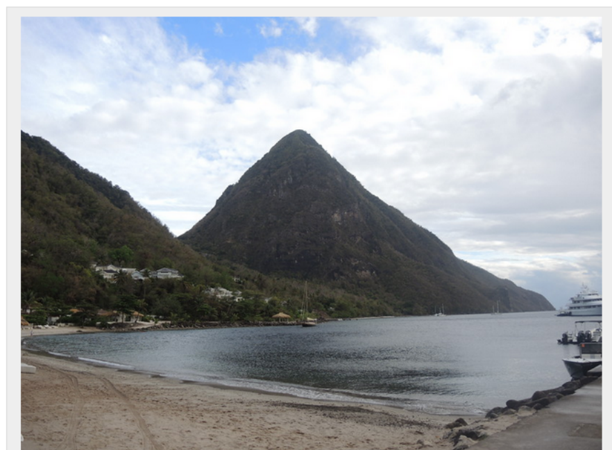
Ending an active afternoon in St Lucia by relaxing at the beach.

While you're waiting for your bar to set, enjoy lunch at Boucan, the resort restaurant situated in the trees. Every item on the menu incorporates chocolate in some form (there is even chocolate butter for your bread, chocolate in the salads, and cacao tea). Pure heaven for chocolate lovers.