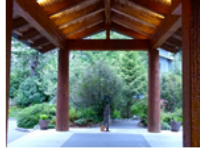
Luxury in a natural setting at The Wickaninnish Inn