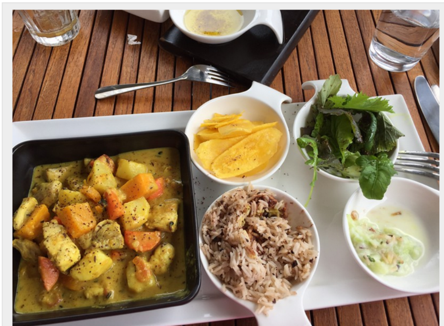
You can taste the chocolate influence in every item at Boucan, Hotel Chocolat's restaurant.

While you're waiting for your bar to set, enjoy lunch at Boucan, the resort restaurant situated in the trees. Every item on the menu incorporates chocolate in some form (there is even chocolate butter for your bread, chocolate in the salads, and cacao tea). Pure heaven for chocolate lovers.