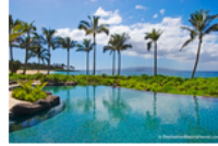
Relax in Luxury at Wailea Beach Villas