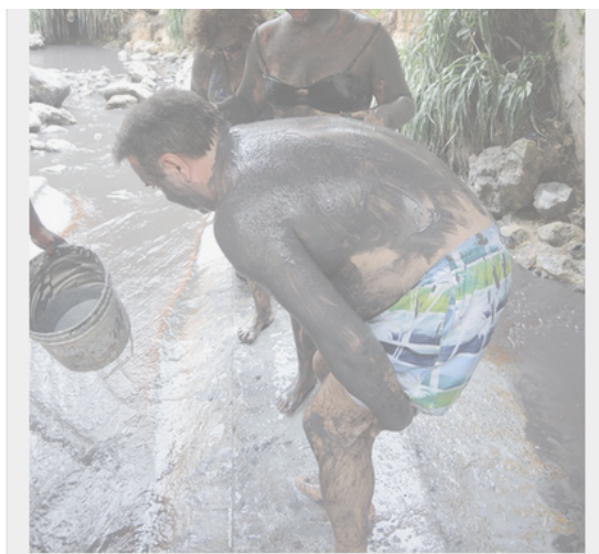
Taking a mud bath in St Lucia

Once you're wet, you'll climb out the other side and stand in a trickling stream while friendly attendants bring over a bucket of fresh sulphur mud and madly begin smearing it all over your legs and arms. Fortunately, they then let you cover the rest of your body yourself and helpfully take a photo with your camera. You go back into the pool and rub the mud off and relax. When you emerge, your skin feels incredibly soft, but the price for silky skin is that you stink of sulphur. Head directly to the outdoor (cold!) showers! There are dark little changing rooms where you can dress. Don't be alarmed if one of the mud attendants says "pssst" and clandestinely holds up a bag of mud for you to buy (we politely passed).