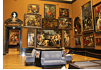
Luxury In Vienna: The Pamper Guide