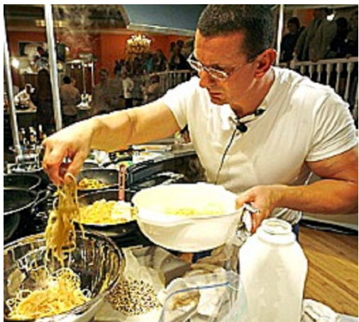
Chef Robert Irvine dishes it up on Restaurant Impossible

Sandwich King: I can't get enough of this show, starring cute and personable Jeff Mauro. He makes everything into sandwiches ( chicken mole sandwich anyone?) and I always applaud his creativity and yummy creations. I want to have lunch with him every single day.