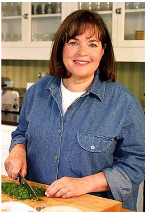
Ina Garten, a.k.a. The Barefoot Contessa

Barefoot Contessa: I adore Ina Garten and all of her “How easy is that?” recipes. I own several of her cookbooks, and some of my all-time favorite recipes come from her ( her Lemon Chicken with Satay Dip is my go-to for casual dinners with friends). Ina used to work for the government as a nuclear policy analyst, which I think somehow taught her to be so calm.