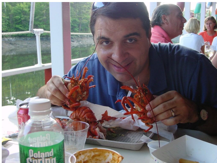
Lobster dinner in Maine

I have returned to Maine twice as an adult. On our last trip, we rented a house on the water in York Harbor, much farther south than the Maine I cut my teeth on. We had lobster at the Neddick Lobster Pound and got a kick out of the Ghostly Tours of York Harbor , but it wasn't the Maine of my childhood. For one thing, there was a sand beach in town (nonexistent on the Penobscot Bay) and the beach in front of our house was cliffs — no wandering for me.