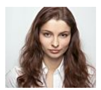
Instant Confidence Boosters

Have you ever tried acupuncture? How did it go?