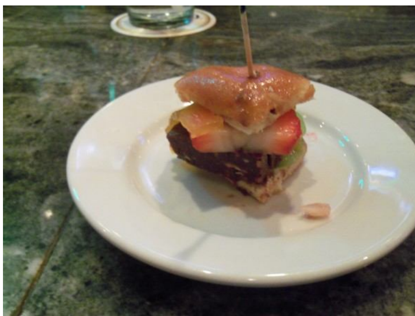
Burger Bar, Las Vegas.

6. Guava Duff in the Bahamas. This local dessert was a big hit with my family. Guava isn't something you normally see on the menu at home and it was sweet and delicious.