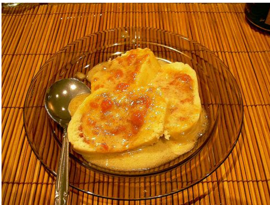
Guava Duff in the Bahamas

7. Lobster in the rough in Maine. I spent summers in Maine, we went back for our honeymoon, and then took the kids one summer. It is one of my favorite places on earth and the best way to enjoy Maine is to dine by the ocean on lobster, corn on the cob, and potato chips.