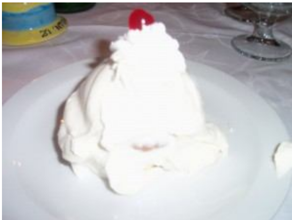
Sorrento Lemon Cake, Amalfi Coast, Italy.

2. Tea at the Orangery at Kensington Gardens, London. This was a wonderful experience in a beautiful setting. The tea, sandwiches, and desserts were magnificent.