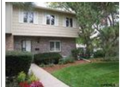
Omaha, NE More Details...