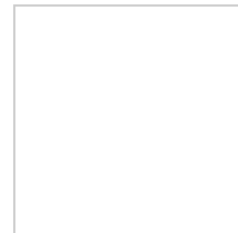
Two-Tone Swap Tote