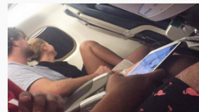
Woman Live-Tweets Insane Plane Break-Up, Teaches Us Many Lessons