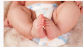
No More Baby Blankets: A Real Life Baby Shower Guide

6. Pudding in a can. Although peeling off that lid and licking it was pretty damn fun, the sharp edges threatened tongue amputation. And pudding always got stuck in that little ridge around the edge of the container.