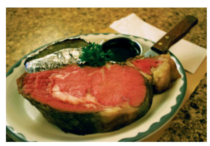
Prime Rib at Wisconsin Supper Club

Jello is considered a salad. After you've filled yourself up with red meat or fried fish, you'll want to end your meal with a grasshopper sundae.