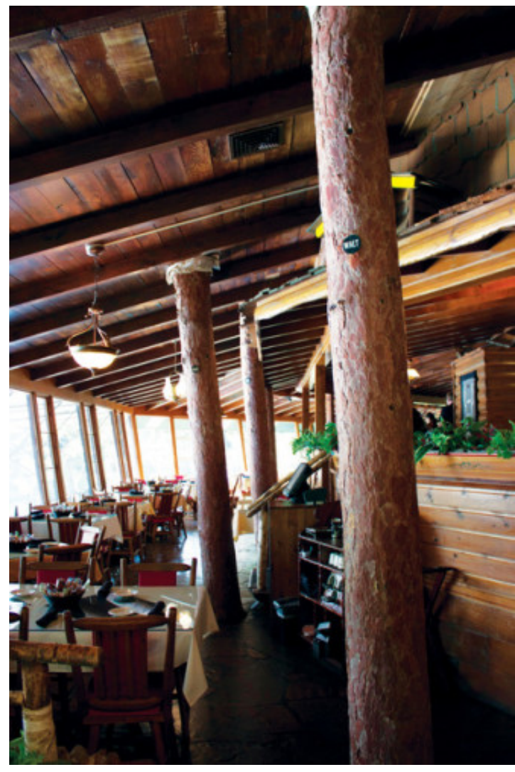
Ishnala Supper Club in Lake Delton, Wisconsin.